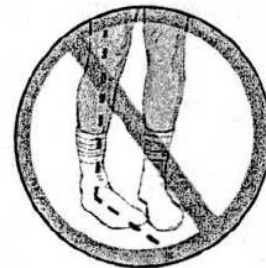
Don't turn your operated leg inward (pigeon-toed).