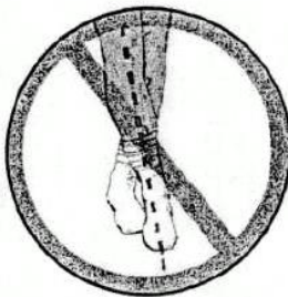
Don't cross your operated leg over your other leg.